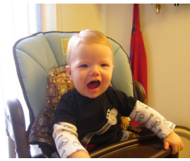
Screaming in my highchair