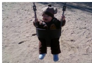
A cold morning in So Cal. My first time on the swing!