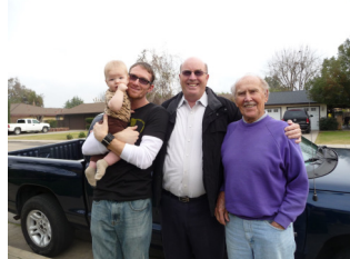
At Grandma's House!