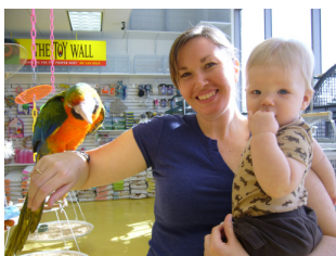
Mommy & I on a MOPS field trip to see birds!