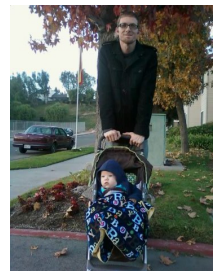
With daddy on a cold day in Dec.