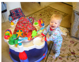
I love to stand!